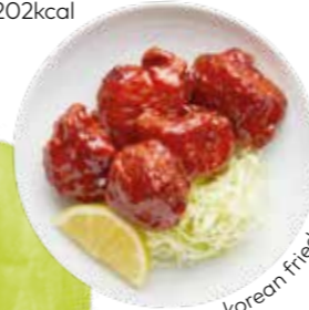
Korean fried chicken